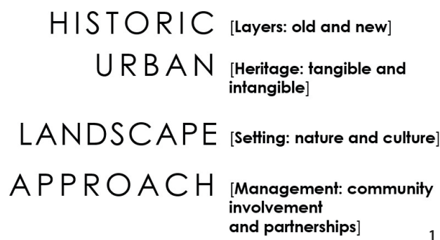
Figure 1 HUL approach and its attributes.

In the presence of robust commitment of the international community set out in the unanimously agreed international mechanisms such as the 2030 Agenda and the New Urban Agenda, it would be a second missed opportunity after the case of Geddes to leave out integrated urban management approaches from current practices that allow an inclusive heritage discourse. The potential existing in the HUL Recommendation should be harnessed to the