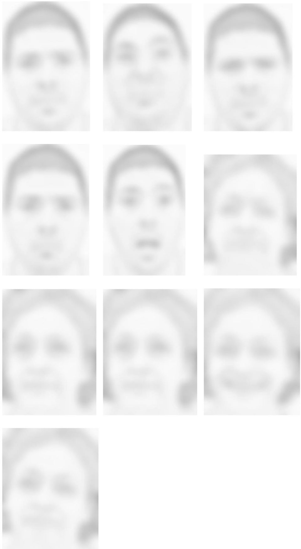
Fig. 2 Facial Expression Discrimination Task used by Vigil (2010)