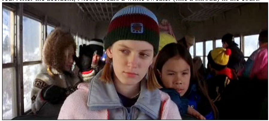
Figure 2. Survivor's guilt in The Sweet Hereafter

In this story of ultimate family disintegration, dysfunction and guilt, nature appears again as an oppressive force. The dominant colors in the film are steel-blue and white. The snow and Rocky Mountains are soft, cold, deadly and white. In this cold blue isolation of the individual, the yellow school bus represents a defective and catastrophic man-made instrument. It is the same with Nicole's wheel chair as if it is the extension of the bus wreck (like the tale she tells). The color blue appears from the beginning to the end of the film. For example, in scenes with Nicole, blue light falls on the wooden walls in the interiors. When not blue, the sky is pale in opposition to earthly wasteland of mud. Nicole always wears light blue clothes. This is the robe of her innocence and guilt. The bus as wreckage echoes the children's cries to bystanders. Another strong color in the film is red. Zoe wears red, calling from phone booths from out of nowhere. Nicole wears a red shawl that belonged to Billy's wife. Also the entrance to her house is painted in red. After the accident, Nicole wears a white sweater (like a shroud) in the court.