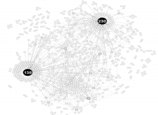
Figure 1. The nodes sized by betweenness centrality

Node# 138 and node# 230 are ranked much higher than the rest with 0,226 and 0,225 in terms of betweenness centrality shown in Table 2 (normalized between 0 and 1) respectively.