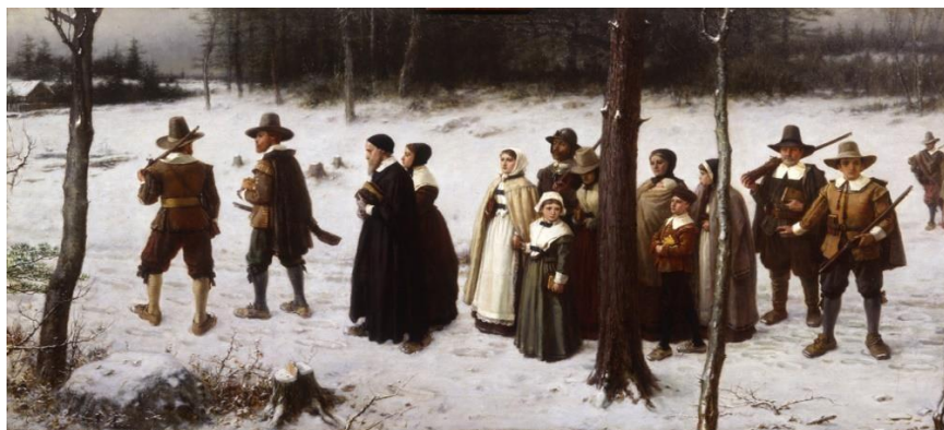
Image 2.1 Boughton, George. (1867). Pilgrims Going to Church. [Oil on canvas] New York City: New-York Historical Society.

Also, this hesitant group, is confined with a blackening wood and this darkness is nothing but the fear of the wilderness' existence. The transformation of space in American art that will be seen also in the upcoming chapters goes hand in hand because depending to the isolation, the environment depicted seems parochial but with coming of the expansionist foreign policy the scene is enlarged in paintings. The painting, as American nation typify a group that condensed their own work and walking on their own path as in Early Republic's foreign policy actions. The way that group isolated from the outer environment is a great symbol because there is no dynamic but the dangerous wilderness, they only walk skeptically against any sudden threat. That is why, even though the painting depicts a moment pertaining to the Colonial Period, it symbolically narrates the nation's standpoint on foreign policy through the Puritan perception of wilderness