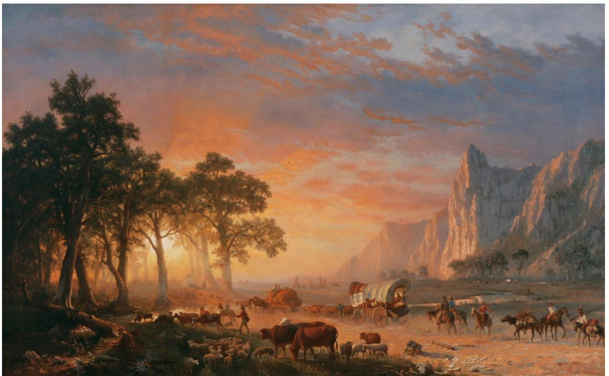
Image 3.1 Bierstadt, Albert. (1869). Emigrants Crossing the Plains. [Oil on canvas]. Oklahoma City: National Cowboy and Western Heritage Museum.

Albert Bierstadt's paintings are symbolic related with the meaning of the claim. In his paintings, Eden-like West or frontier is depicted such a space that waiting to be transformed with the light of civilization, the sublime. His 1867 dated painting Emigrants Crossing the Plains is a painting reflexing entirely the mentioned spirit. When Boughton's Pilgrims Going to Church from the first chapter were juxtaposed with this painting, it displays how the symbolic meanings in American Art and Literature show an alteration and correspondingly their influence on foreign policy.