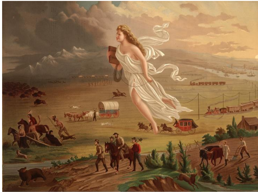
Image 3.2 Gast, John. (1872). American Progress . Chromolithograph published by George A, Crofutt.

The tremendous angel adjusted right into the middle of the painting assistive in pioneer's mission to explore as they are coming with the wagons, walking with their digging tools and cultivating the soil. She carries a book that can be read with an observantly look: Holy Bible. This depiction is nothing but the promotion of U.S' elected status, as God's will is with them, an angel is escorting to the pioneers. The angel also holds telegraph wire's continuation in her hand, as if she physically actualizes the progress of the nation in the new lands. As there is no female among the pioneers, this reflects the male dominant nature of this expansionism, but it is extraordinary that divine power's manifestation as a female figure creates the insight of correlation between mother nature. As in Bierstadt's painting, the nature brings to pass no entanglements keeping pioneer away from the course. In a nutshell, all physical and spiritual powers are providing convenience for the American expansionism. In that sense, representative paintings related with the new trends of progressivism paves the way for theoretical basis of exceptionalism in foreign policy. In this way, the foreign policymakers and the public found their decisions as justified and essential sentiments in this path.