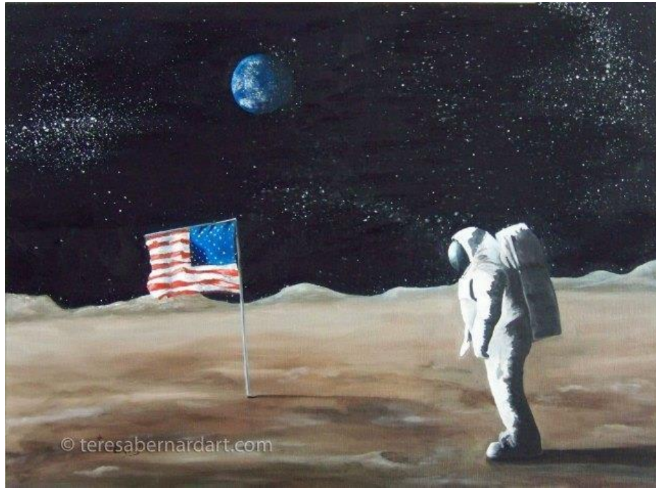
Image 4.1 Bernard, T. (2012) First Man on the Moon [Gallery wrap stretched canvas]

Preemptively, when it is looked to the painting, the depth proportion of the world seems to look appropriate when it is compared to the American flag's greatness. Still, the magnitude of American flag is large intentionally in a respectable amount. Thus, the greatness of American nation on the world is directly proportional with the American flag standing in front of the world. On the other hand, the area that astronaut lays weight on is considerably luminous when it is compared to the rearward darkness. The luminousness of the field identified with American flag recalls the idea of isolationist foreign policy in the early republic as an extension of American exemplary identity. It is because the main wish is to avoid foreign wars unrolls the American distinctiveness because the outer realm seems murky, incomprehensible and absorbing. Also, inclusive of isolationist view, the painting's dynamic spawns an aloofness indisputably. A national flag, an astronaut doing his duty behalf his nation and a physical appearance of the world elucidates the American loneliness in the system over three signifiers.