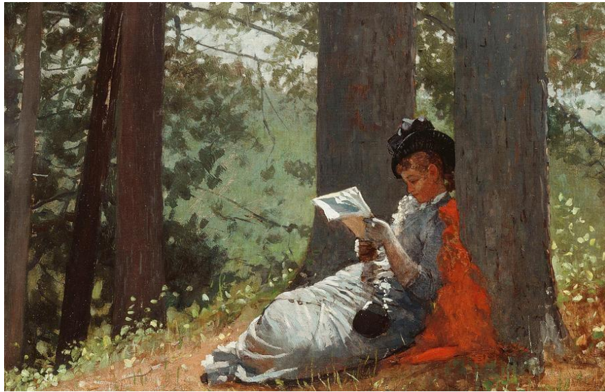
Image 2.2 Homer, Winslow. (1879). Girl Reading Under an Oak Tree . [Oil on canvas] Private Collection.

This influential figure fleshes out the story of “American Isolationism” with his 1879 dated Girl Reading Under an Oak Tree ( Image 2.2 ) painting. On the contrary of Boughton’s depiction of wilderness, in Homer’s view the forest’s being illuminated with lighter colors, evokes a peaceful atmosphere and this peace presumably brought by isolationism to the internal dynamic of the nation. There is an orangish shawl behind of fashionably dressed woman and this shawl keeps away the leaves and other distractions. Even, this woman is so concentrated to her book that nothing around divert her attention away. The same determination can also be seen in Boughton’s Puritans. On the other hand, the woman’s leaning on to the oak tree is not random because oak symbolically stands for power and wisdom. That way, reflection of oak tree establishes a connection with the U.S policies’ correction on what they do as the isolationist foreign policy depended upon self-reliance, manifests in paintings with these effects on its characters. Also, American distinctiveness and so-called greatness in this distinctiveness is depicted through a woman relating her to the American nation. The portrait of the American nation as a woman was uncommon on the period even though in the process of the discovery of the new land mostly metaphorized over a virgin waiting to be explored, still the