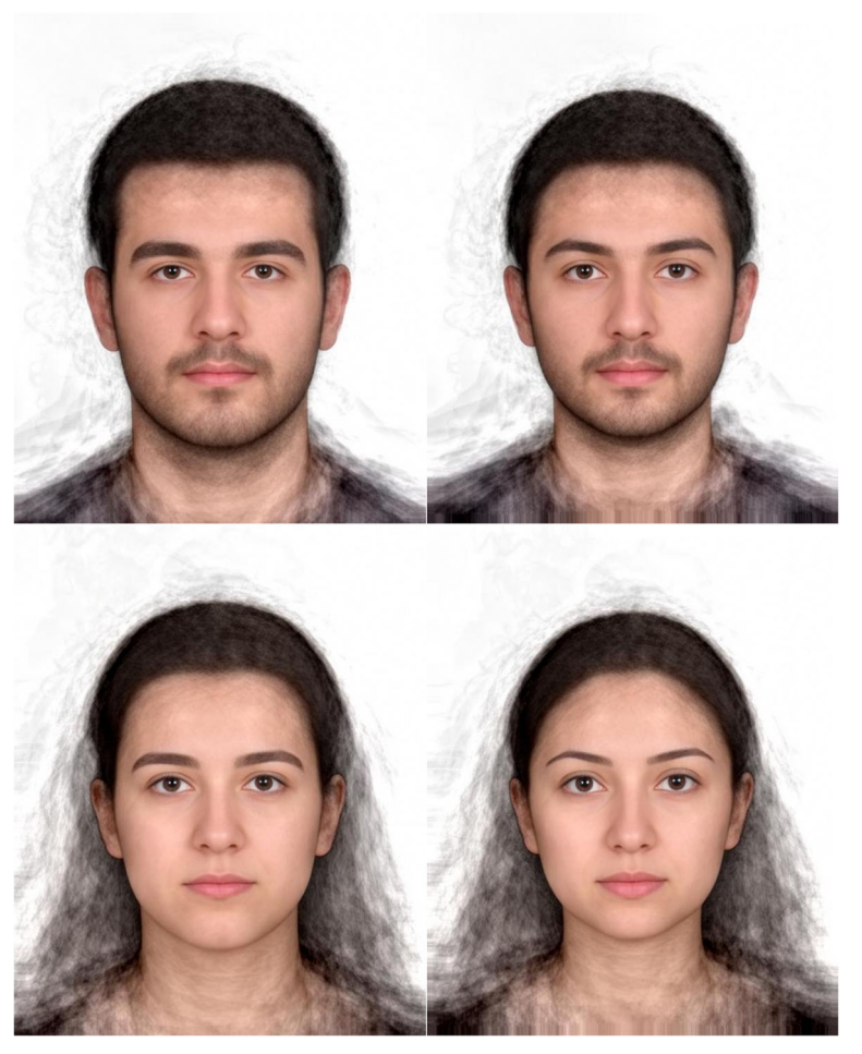
Fig. 1 Examples of the sexual dimorphism transform applied to male (top row) and female (bottom row) face prototypes. Masculinized versions are shown in the left column and feminized versions in the right column.

Forced-choice paradigms can produce qualitatively different patterns of results to other methods for assessing perceptions of faces (Jones and Jaeger 2019). We used the forced choice method in the current study to allow our results to be directly compared with previous research investigating putative links between self-rated attractiveness and face preferences.