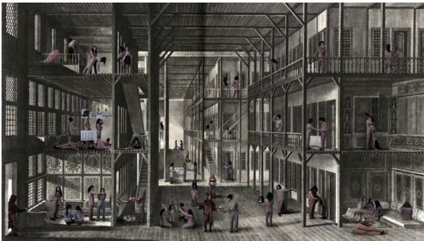
Figure 1. Harem , 2009, with the permission of Inci Eviner, the artist and the copyright holder.

The objective of Eviner's Parliament 8 (2010), in a way, is to explain the ideal European myth woven through with the discourses concerning refugee assimilation processes by bringing to life a cross section of the European Parliament building and exposing its inner goings on, and to expose the 'post-truth' of EU discourse through the cutaway.