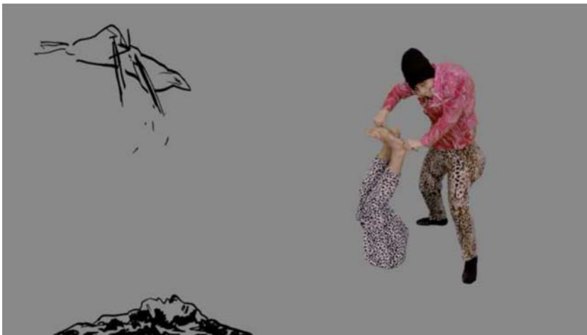
Figure 9. Turkey Pavillion, Venice, 2019, with the permission of Inci Eviner, the artist and the copyright holder.

All apparatuses of capture need their lifeblood from the outside, from the domain of free use. However, free use is that which cannot be included within and thus challenges