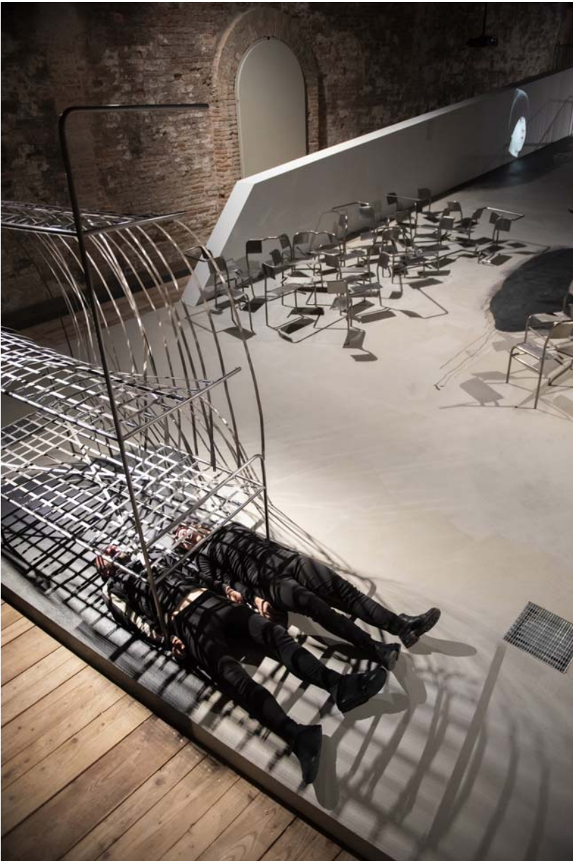
Figure 4. Turkey Pavillion, Venice, 2019, Photo Credit: Poyraz Tütüncü, with the permission of Inci Eviner, the artist and the copyright holder.

exception, in which the exception has become a norm (see Benjamin 1992, 248–249). In a culture of exception, the separation between normality and exception no longer works. And so, the paradigm of the state of exception shifts from the ‘miracle’, the sovereign decision that separates law and unlaw, to the ‘catastrophe’, which implies a zone of indistinction between anomie and law (Agamben 2005, 57). There is no longer any difference between law and violence, nothing except anomie, which power seeks to capture by