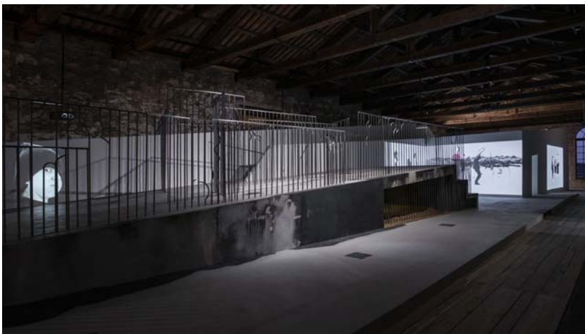
Figure 3. Turkey Pavillion, Venice, 2019, Photo Credit: Poyraz Tütüncü, with the permission of Inci Eviner, the artist and the copyright holder.

A scattered, suspended metal structure of a double bunk, abandoned, fatigued and disconnected, stands at the head of the ramp. This, at one time, was the most private, yet also most public, space of an emergency or temporary lodging area – a refugee or labour camp. The cluster of half chairs standing haphazardly, motionless and buried