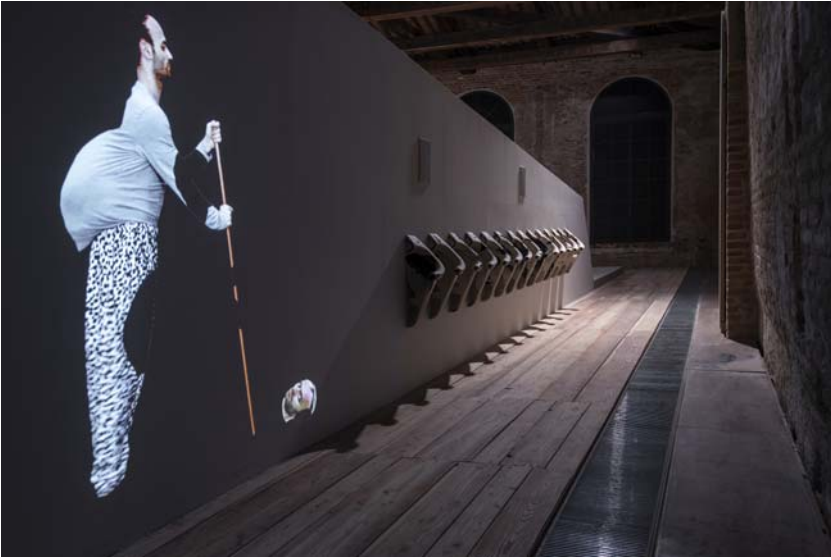
Figure 5. Turkey Pavillion, Venice, 2019, Photo Credit: Poyraz Tütüncü, with the permission of Inci Eviner, the artist and the copyright holder.