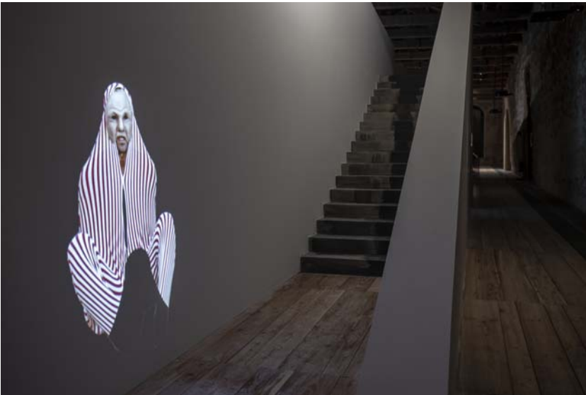
Figure 7. Turkey Pavillion, Venice, 2019, Photo Credit: Poyraz Tütüncü, with the permission of Inci Eviner, the artist and the copyright holder.

Let us consider a few instances of this unity in disunity, disunity in unity of the tragic and the comic in We, Elsewhere . First: a masked roly-poly in a striped, elastic costume continuously rolls to its back and then back up. It takes pleasure in endlessly toppling over and righting itself despite the goings on in its surroundings. A drawing of a half-beast, half-human warrior, however, orders his shadow to capture the roly-poly. The roly-poly can no longer play and is imprisoned within the shadow, although its facial expression maintains its playfulness. Second: two people, their faces bundled up and hidden, walk back and forth in front of a pastoral silhouette, as if dancing. They are in a state