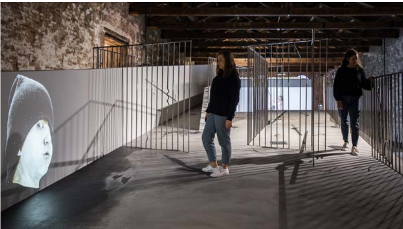
Figure 6. Turkey Pavillion, Venice, 2019, Photo Credit: Poyraz Tütüncü, with the permission of Inci Eviner, the artist and the copyright holder.

depicting it as a deficit of social order. Unmasking this depiction, Eviner's artistic strategy is to demonstrate that anomie cannot be captured by power, and to affirm a sense of anomie vis-à-vis the culture of exception. What transpires in this demonstration is not the destruction of the law, the bodies or sociality as such but a de-activated law, another use of the bodies and intimations to another sociality, an everyday life beyond the grasp of the law.