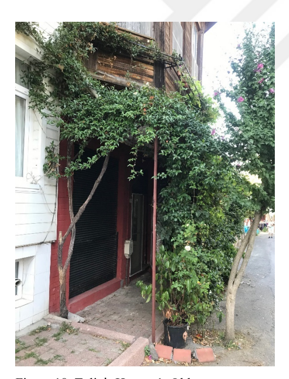
Figure 18. Tülin's House_1, Old grocery store, now it is a secret library.