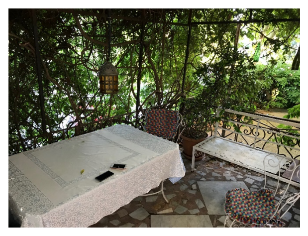
Figure 14. Tülin's House_2_The patio