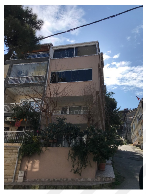
Figure 4. Şükran's flat on the top floor at the apartment belongs to the family.