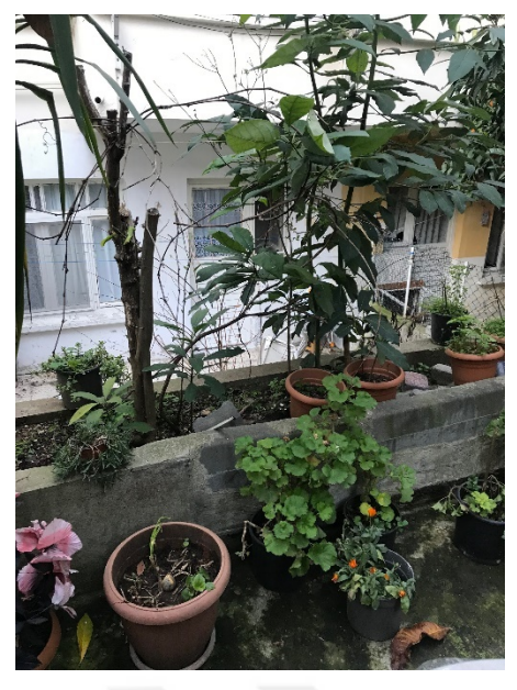
Figure 12. The adjacent backyards of Nermin and her next-door neighbor