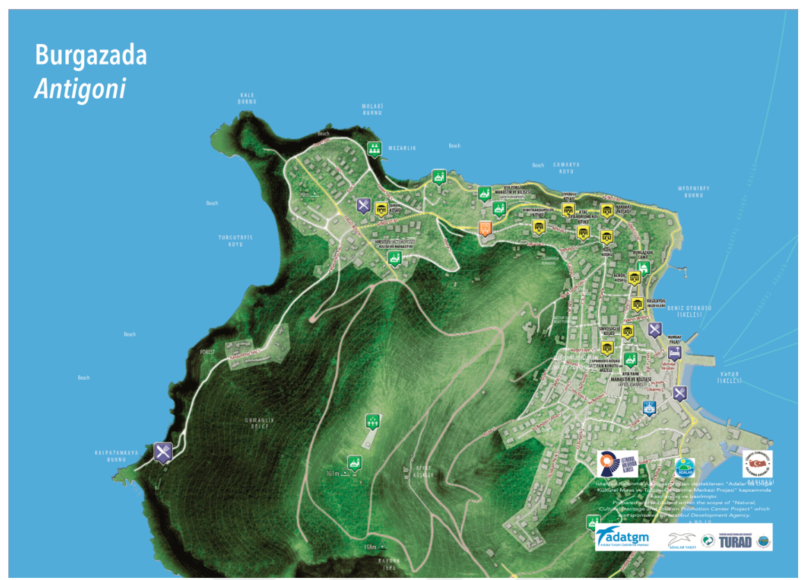
Figure 3. Map of Burgazada (Adalar Vakfı, 2014)

The previous section has described the meanings attached to the 'island 'and the interpretations of the 'islander identity', concerning the accounts of the informants. The chapter aims to introduce the particular places on the island and the daily practices through which the identities are negotiated within these public and domestic spaces. When thinking of Burgazada, most referenced places by the informants are beaches, clubs, institutions, volunteer centers, restaurants and the outdoor market. According to Serpil (female, 62), since the island is small, the most remote places on the island are 20 minutes away on foot. Thus they can go anywhere on the island quickly; however, they mostly spend time in specific places.