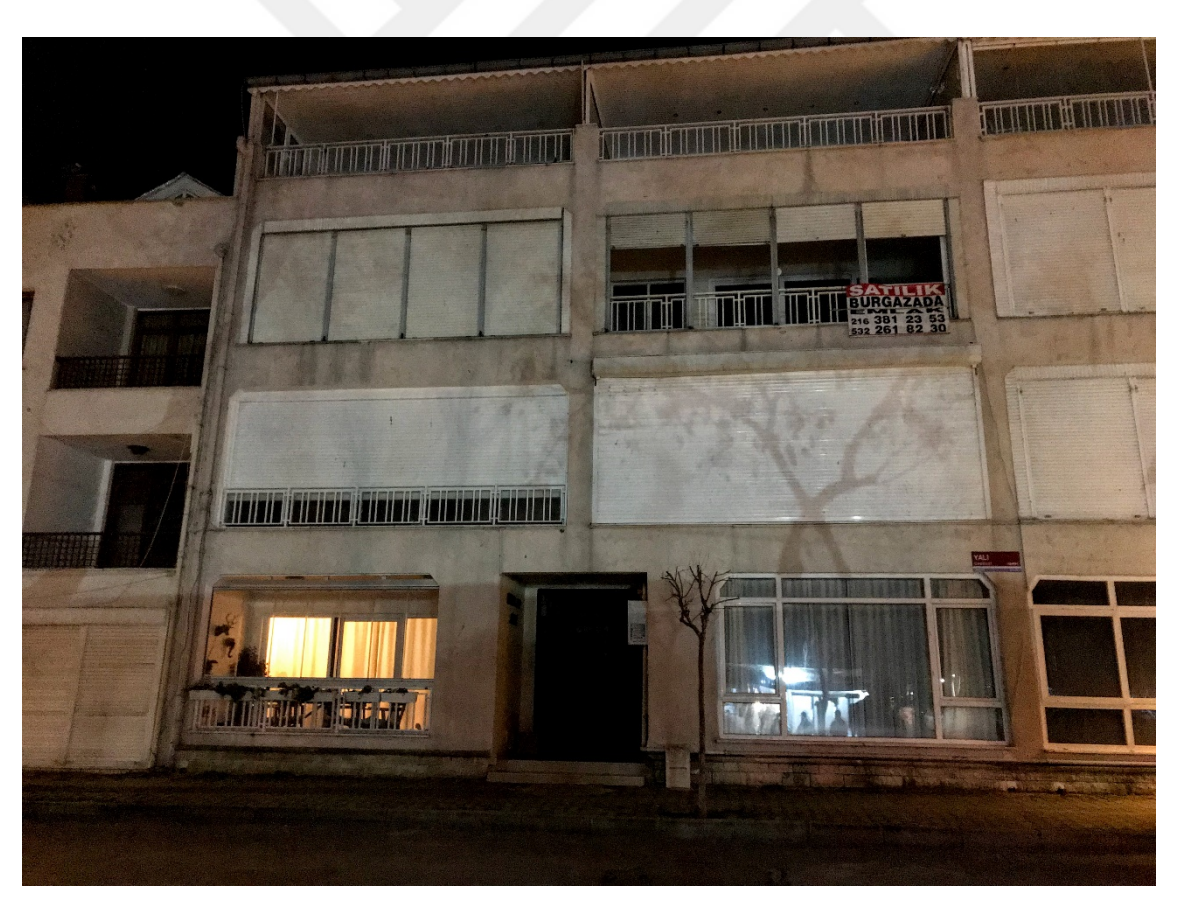
Figure 20. Serpil's Flat