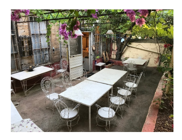
Figure 9. Tülin's House_2_The backyard