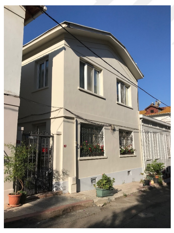
Figure 8. Mehmet's House