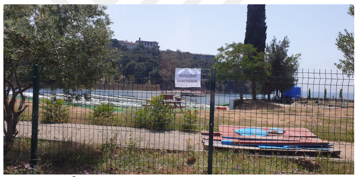
Figure 2. "Adalılara Ücretsizdir" ("Free for the Islanders"). (Adalar Savunması, 2019)

"Eventually, in all these years, fifteen years, all the bays here even the small ones which were public before, have enterprises nowadays. Maybe this way is better. Because as the population increases, it got more difficult to keep these areas clean. In the past, only islanders used to go these bays, clean around and leave. Now in these crowd, if everyone who goes there leaves trashes, it would be impossible to go there. At least these operators probably do this with the permission from the city halls. Therefore they are keeping there clean, maintaining, serving the visitors. After all, I think it's good to have them here. It is a matter of supply and demand. Since the island is having these many visitors, having all these enterprises is convenient. From now on there is no bay/beach that we can enter freely including Çam Limanı." (Tülin 62)<sup>28</sup>