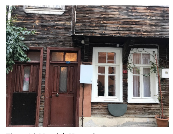
Figure 16. Nermin's House_2