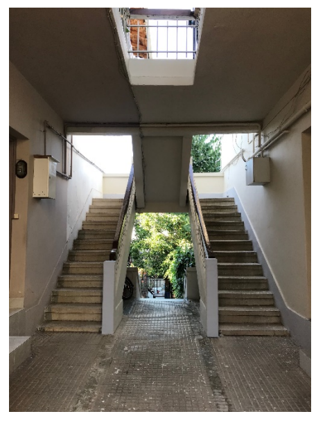
Figure 11. Mehmet's house, The interjacent area between twin houses