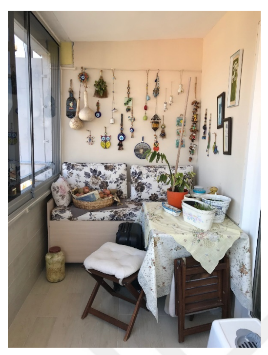
Figure 19. The Balcony of Şükran