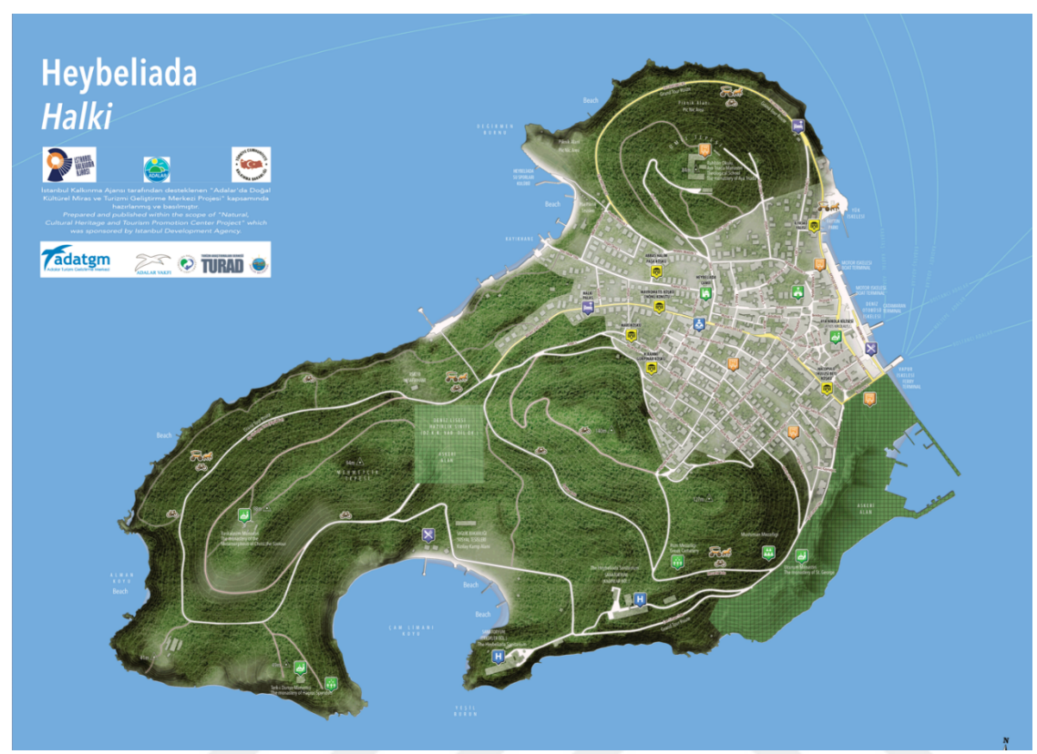
Figure 1. Map of Heybeliada (Adalar Vakfı, 2014)

So far, the research has focused on the interpretations of the island regarding various aspects and the processes through which the 'islander identity 'is constructed. In the following section, I will discuss how my informants see and experience their surroundings and act in it. Furthermore, I will try to understand how they negotiate their identities with reference to these places. While examining specific places and their interpretations by my informants, I will also try to explain their daily routines and how each one perceives everyday life on the island.