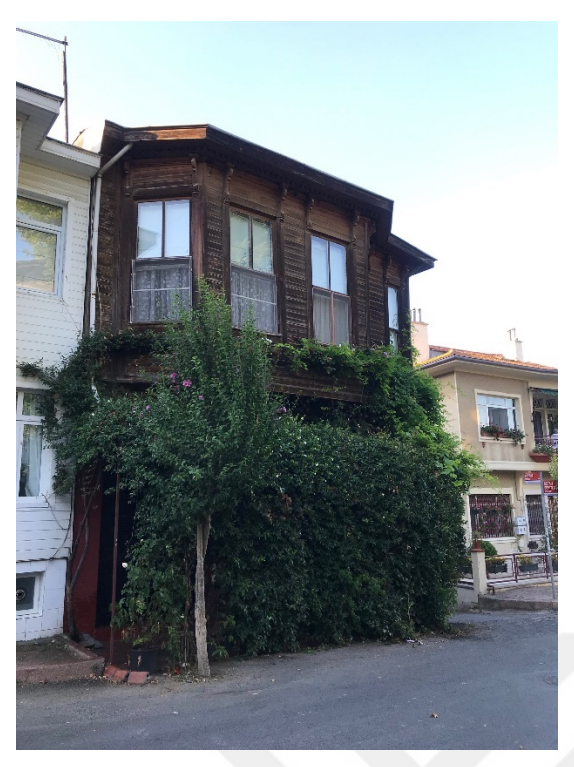
Figure 7. Tülin's House_1