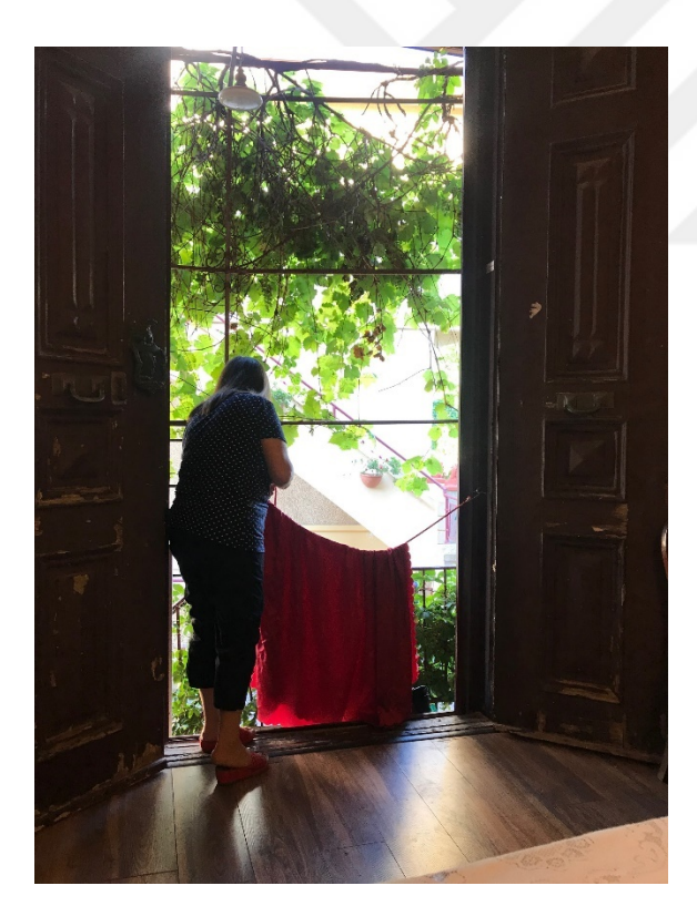
Figure 13. Tülin's House_1