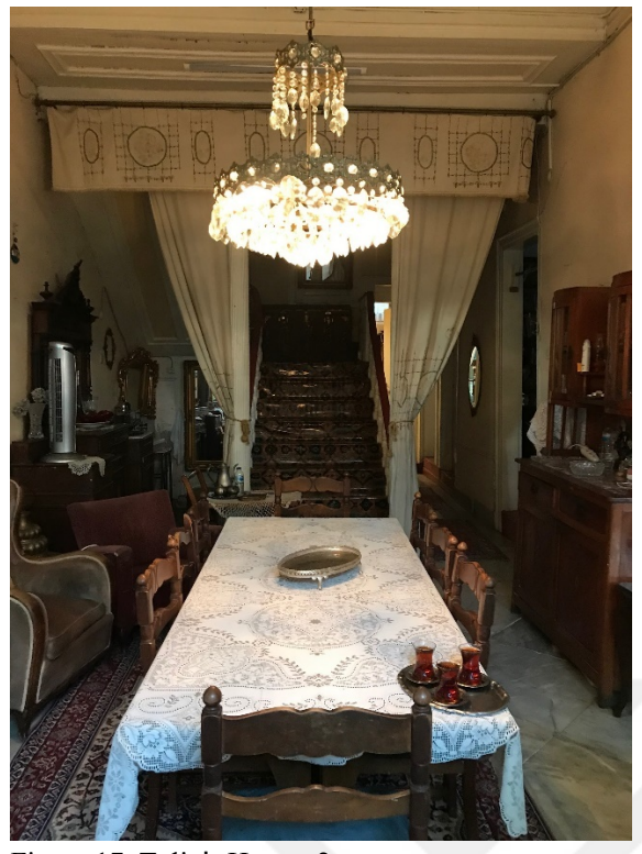
Figure 17. Tülin's House_2