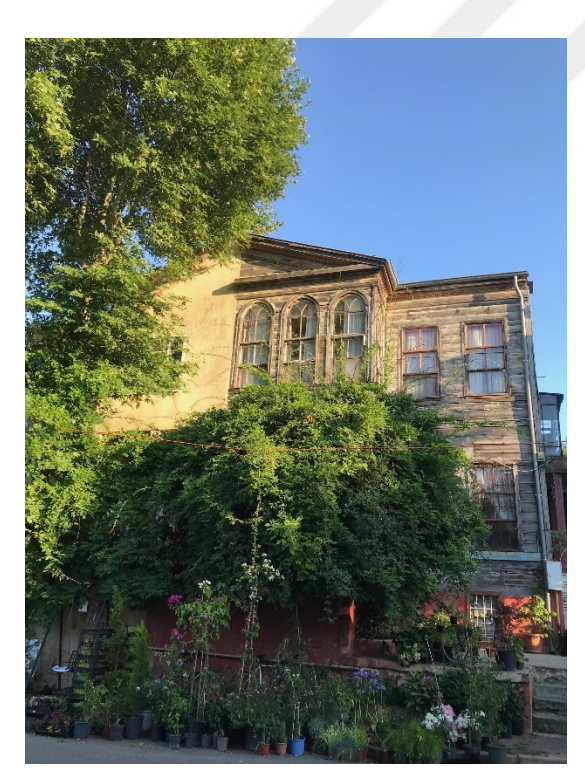
Figure 6. Tülin's House_2