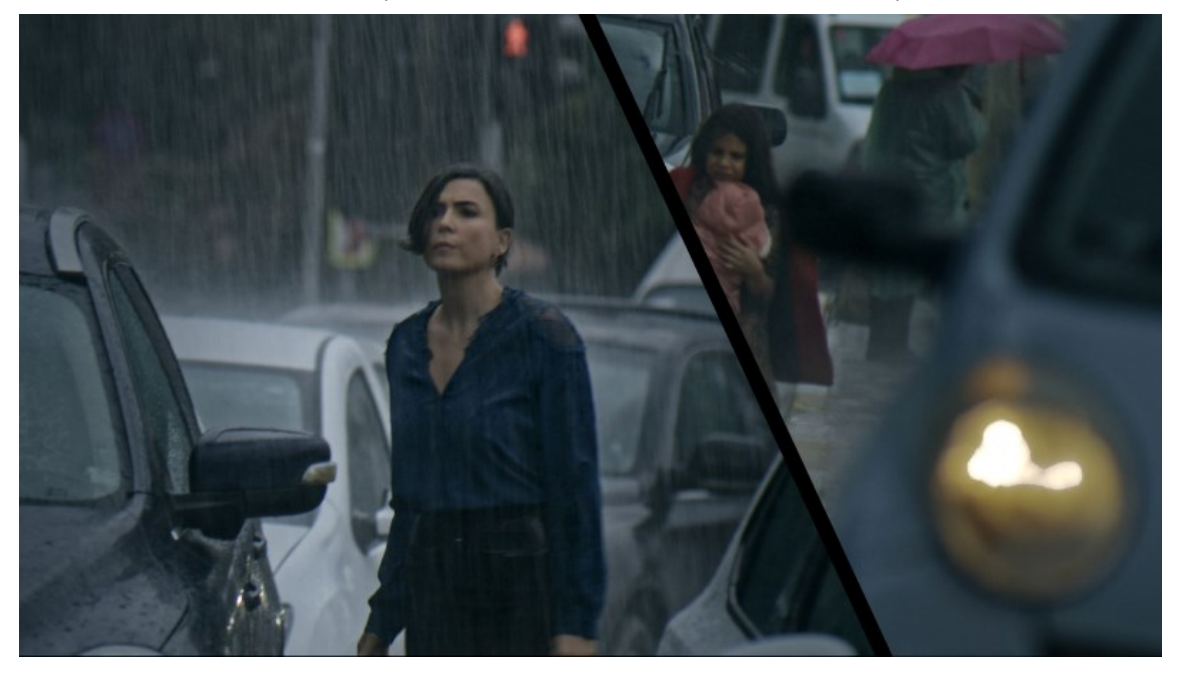
Figure 2 The scene from the Guest (Misafir, 2017): Lena searches for help in heavy rain for her sick baby sister, while the bourgeois benefactor notices them and decides to help them

her seemingly secure privileged position in the social relations. This is why she asks to her partner what he would do on the last day before some war breaks out here in Turkey.