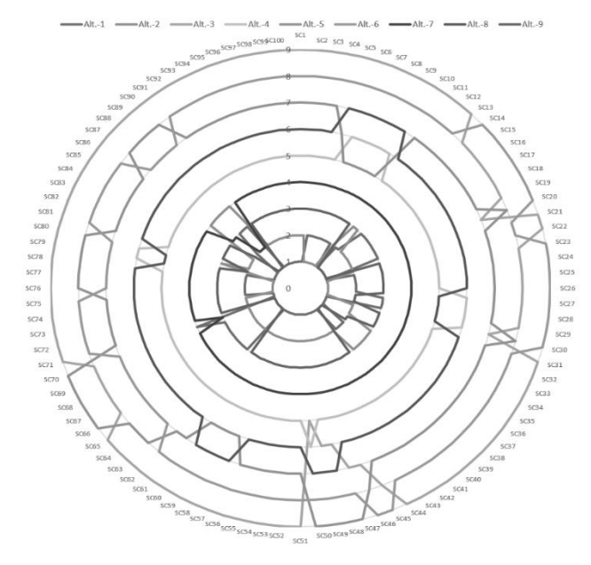
Figure 2. Impacts of changing the criteria weights on the ranking results