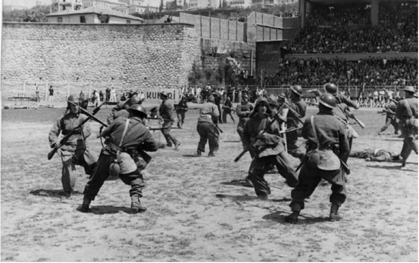
Military high school cadets reenacting the Kunu-ri battle in a stadium in İstanbul in 1951. [Authors' collection]

of the Turk in Korea. 6 Nevertheless, the Turkish Brigade's performance at the Battle of Kunu-ri remains contested as the U.S. and Turkish official accounts of the battle differ substantially.