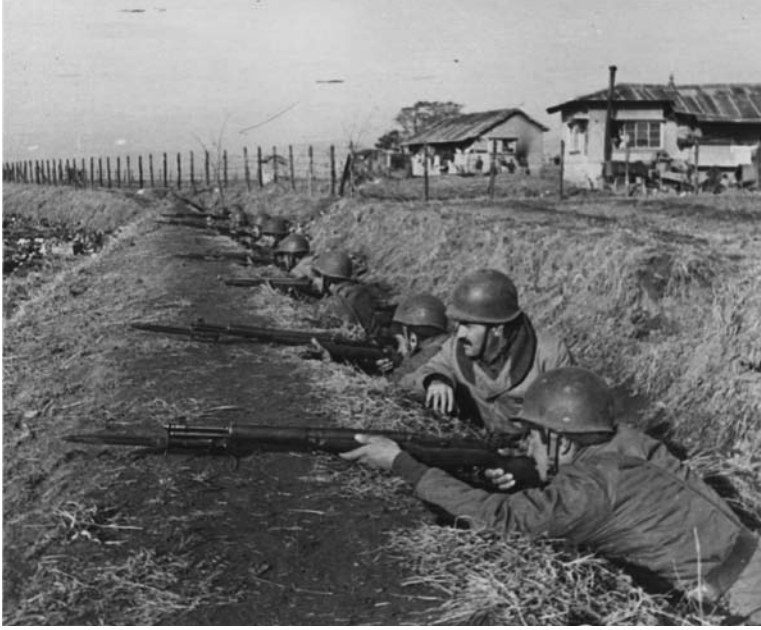
Turkish soldiers getting familiarized with American weapons and equipment in Korea.

than the 241st Infantry Regiment. Building team spirit and unit cohesion proved to be very difficult even for the support and service units for the reasons noted above: lack of time and the means for socialization and frequent rotation of personnel within units. 49 Consequently, the brigade had to be committed to combat without sufficient training or familiarization with its officers and weapons.